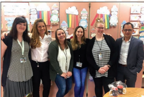
Some great projects from some great teachers funded at Horizon Elementary School in Everett.